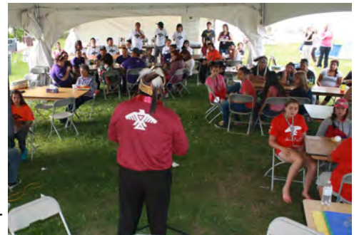
Deputy Grand Council Chief Glen Hare address youth at Beaucage Park Eshkenijig Engagement.