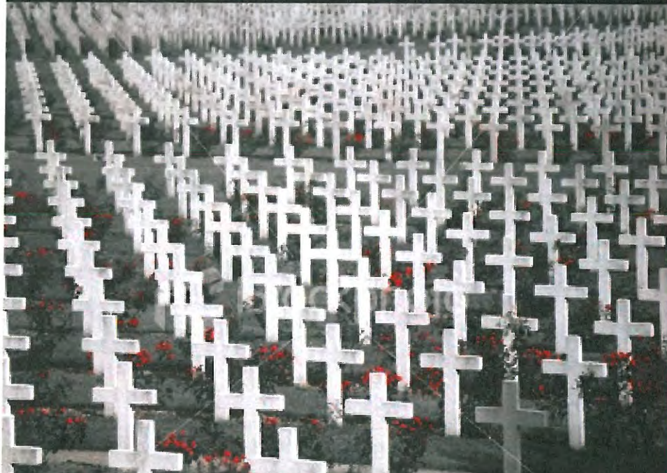
Thousands of graves of soldiers at Flanders Fields