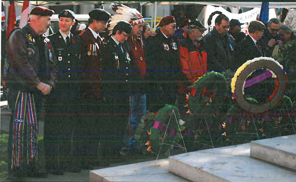
Veterans gather at Victory Square Cenotaph for a National Aboriginal Veterans Day ceremony, November 8, 2013. The ceremony is held to remember Aboriginal, Metis and Inuit men and women who served in the Canadian Forces